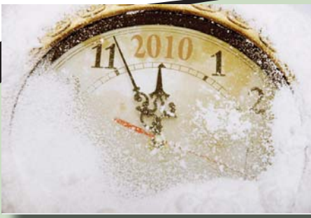
Best wishes for a prosperous 2010